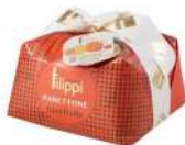
GRANFRUTTA SPE 3403 / SPE 3405 6 x [500g -1KG]