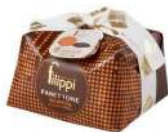
ORANGE & CHOCO SPE 9103 / SPE 9105 6 x [500g -1KG]