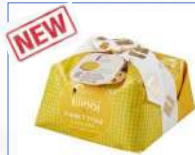
LEMON & MILK CHOCO SPE 3503 / SPE 3505 6 x [500g -1KG]