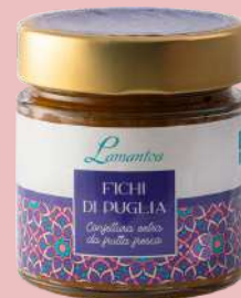
4108 Figs Jam