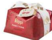
BLACK CHERRIES SPE 1203 / SPE 1205 6 x [500g -1KG]