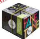
PISTACCHIO & LEMON WITH PISTACCHIO JAR BOX 10705 6 x 1KG