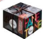
GIANDUVIA & ORANGE WITH GIANDUVIA JAR BOX 11405 6 x 1KG