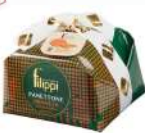
ICED ORANGE (NO RAISINS) SPE 12603 / SPE 12605 6 x 500g / 6 x 1KG