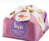
PEACH & AMARETTI SPE 3803 / SPE 3805 6 x 500g / 6 x 1KG