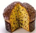
Gocce di cioccolato