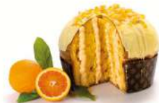
Arancia di Sicilia