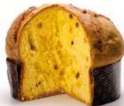
Tradizionale con uvette e cubi di arancia