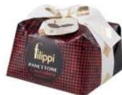
DARK CHOCOLATE SPE 9003 / SPE 9005 6 x [500g -1KG]