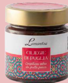
4107 Cherries Jam