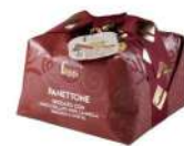
GRAN SPEZIALE SPZ 5005 6 x 1KG