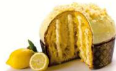
Limone di Sicilia