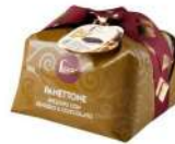
GINGER & CHOCO SPZ 8205 6 x 1KG