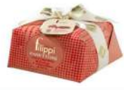
WILD STRAW & MILK CHOCO SPE 8703 / SPE 8705 6 x [500g -1KG]