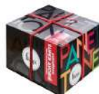
SUPER AVORIE' AVO 8805 6 x 1KG