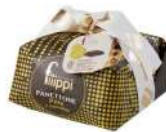
PEAR & CHOCO SPE 7203 / SPE 7205 6 x [500g -1KG]