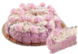
8168 Strawberry & Cream