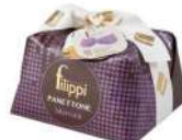
CHESTNUTS SPE 2403 / SPE 2405 6 x [500g -1KG]