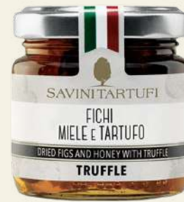
4021 Honey with dried figs & Truffle