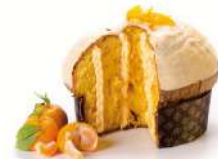
Mandarino di Sicilia