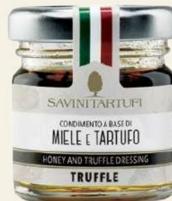
4020 Truffle Honey with Bianchetto