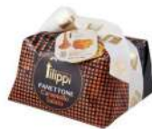
SALTED CARAMEL SPE 5203 / SPE 5205 6 x [500g -1KG]