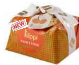
APRICOTS SPE 3703 / SPE 3705 6 x [500g -1KG]