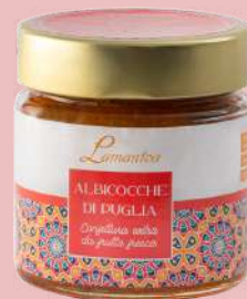
4106 Apricot Jam