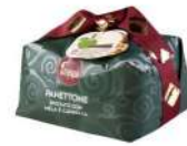
APPLE & CINNAMON SPZ 4303 / SPZ 4305 6 x [500g -1KG]